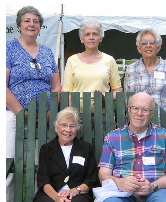
Friends' Weekend 2013

Four of our past Presidents, posing with our current President.